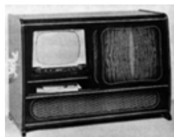
TV - music-cupboard "Lugano"